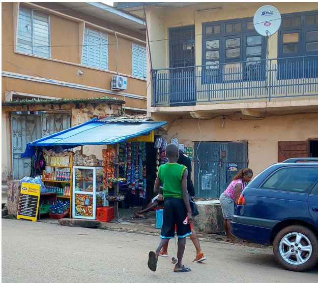
Figure 3 HBE in Uwani managed by a woman and involving the use of a temporary structure